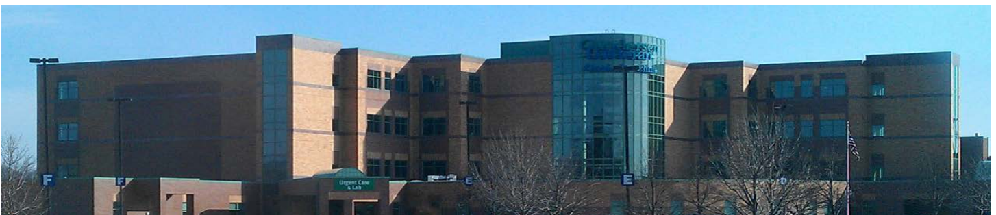
Gundersen Lutheran - Onalaska Clinic